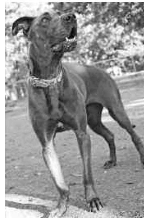
Bloom watching a squirrel.

In spite of the fact that she currently lives in a constant state of discomfort, you will never see Bloom feeling sorry for herself. A dog with a perpetually sweet and silly disposition, Bloom is social with dogs, disinterested in cats, and fantastic with children! She would thrive in almost any family setting. While small for a great